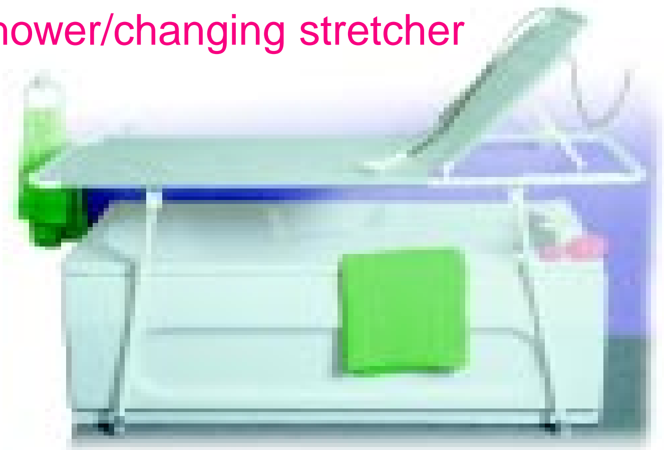
T12 Wall mounted tip-up shower/changing stretcher with adjustable back