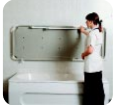
Folds neatly away

complete access to the bath or other facilities when required. A version with back support (T12) is available, which can be adjusted to seven positions, allowing the user to sit up if required.